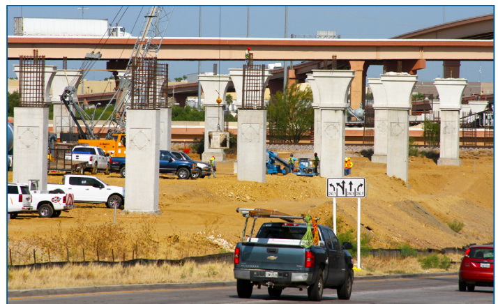
Construction of Interstate 69W mainline bridges over Interstate 35 and Union Pacific tracks in Laredo